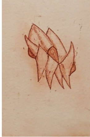
Alex Byrne, Barka 2 - Sturt Desert Pea , 2020

Aquatint; Barka/Darling series on Hahnemuhle 300 gsm 1 AP + 5; 160 x 220