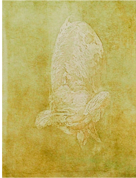
Alex Byrne, Barka 8 - Macquarie Perch , 2020

Aqua-tint; Barka/Darling series on Hahnemuhle 300 gsm 1 AP + 5; 220 x 280