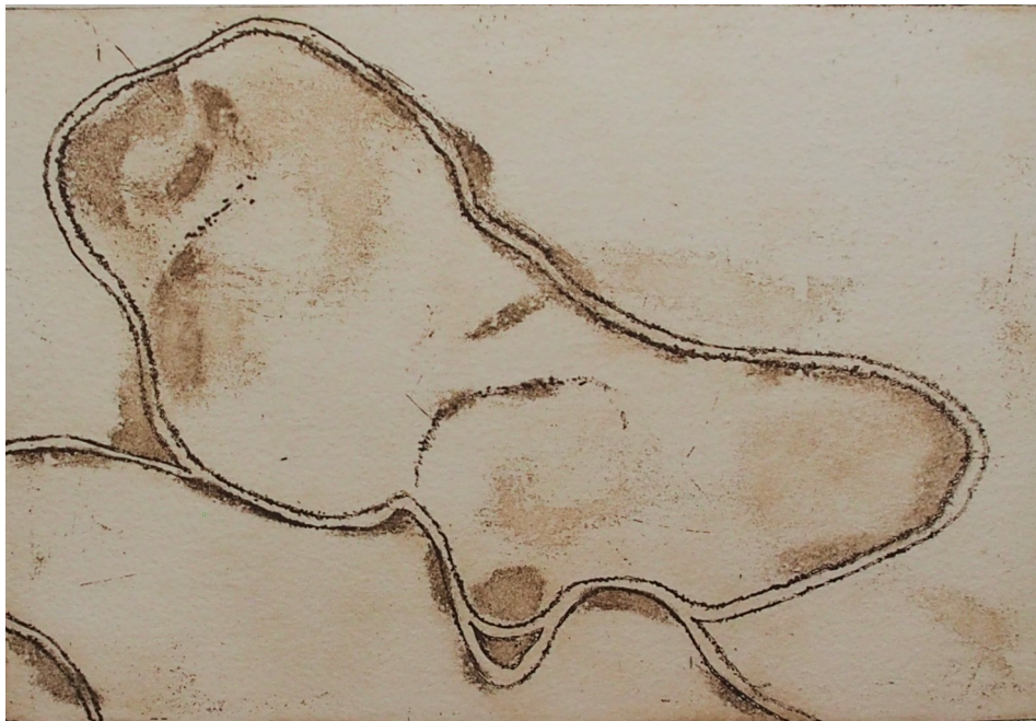
Alex Byrne, Barka 3 - Darling Loop , 2020

Aquatint; Barka/Darling series on Hahnemuhle 300 gsm 1 AP + 5; 350 x 250