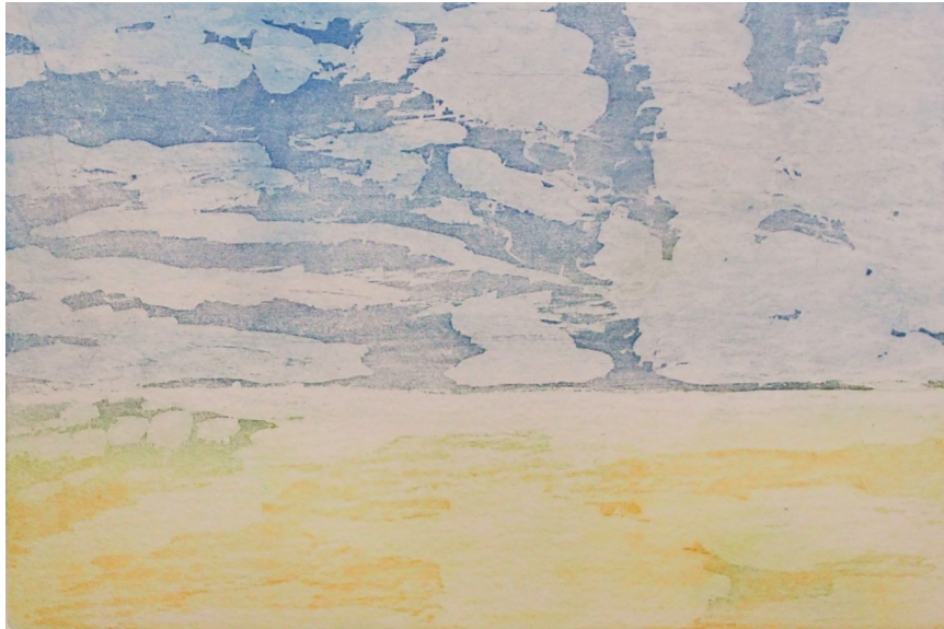
Alex Byrne, Barka 5 - Big Sky , 2020

Aquatint; Barka/Darling series on Hahnemuhle 300 gsm 1 AP + 5; 395 x 310