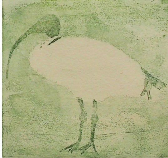
Alex Byrne, Barka 6 – Ibis , 2020

Aquatint; Barka/Darling series on Hahnemuhle 300 gsm 1 AP + 5; 220 x 220