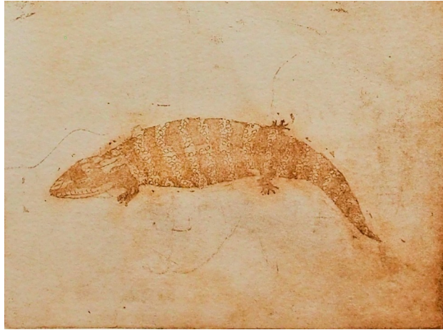
Alex Byrne, Barka 7b – Bluetongue , 2020

Aquatint; Barka/Darling series on Hahnemuhle 300 gsm 1 AP + 5; 260 x 210