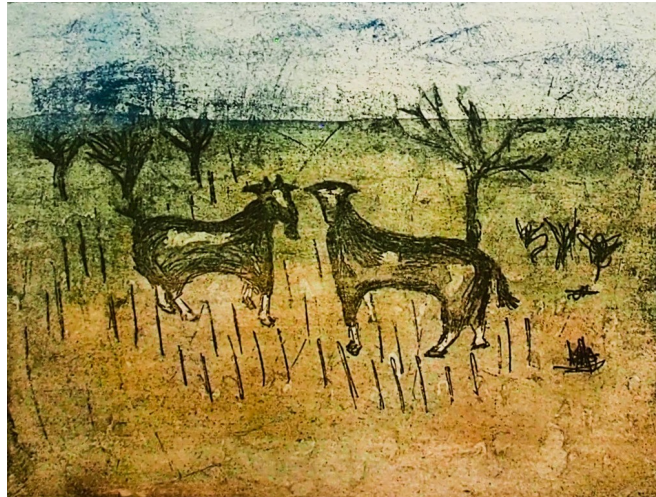
Alex Byrne, Barka 32b - Toorale Goats , 2020

Aquatint & Etching; Barka/Darling series on Hahnemuhle 300 gsm 1 AP + 5; 255 x 210