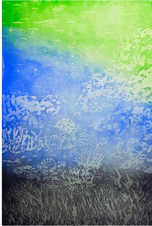
Alex Byrne, Apocalypse 1 - Every living soul died in the sea , 2020

Aquatint; Apocalypse series on BFK Rives Grey 280gsm 1 AP + 5; 380 x 565