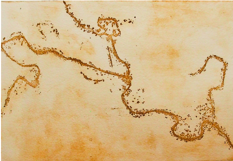
Alex Byrne, Barka 31 - Barwon Junction , 2020

Aquatint; Barka/Darling series on Hahnemuhle 300 gsm 1 AP + 5; 365 x260