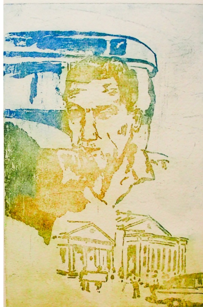
Alex Byrne, Barka 34 - Freedom Ride , 2020

Aquatint; Barka/Darling series on Hahnemuhle 300 gsm 1 AP + 5; 260 x 365