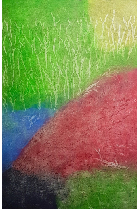
Alex Byrne, Apocalypse 2 - The rivers became blood , 2020

Aquatint; Apocalypse series on BFK Rives Grey 280gsm 1 AP + 5; 380 x 565