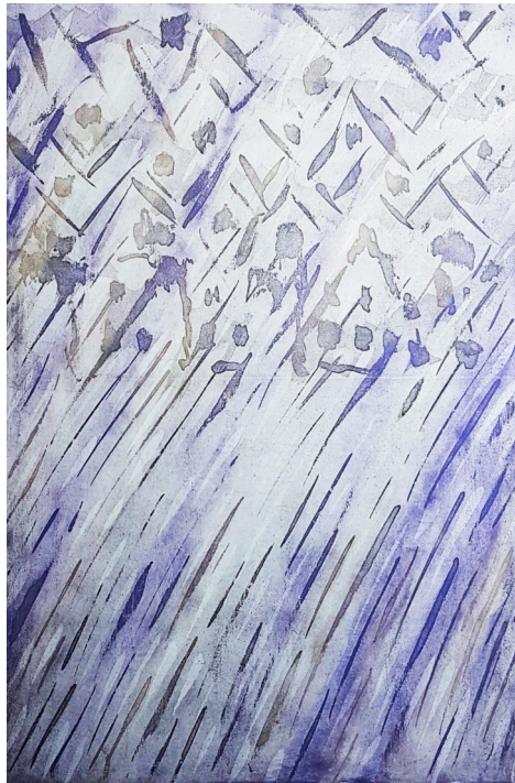
Alex Byrne, Apocalypse 6 Thunders and lightnings, a great earthquake, great hail , 2020

Aquatint; Apocalypse series on BFK Rives Grey 280gsm 1 AP + 5, 380 x 565