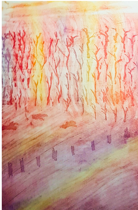
Alex Byrne, Apocalypse 5 Men were scorched with great heat , 2020

Aquatint; Apocalypse series on BFK Rives Grey 280gsm 1 AP + 5; 380 x 565