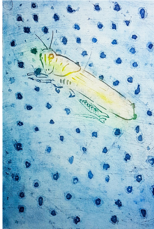
Alex Byrne, Apocalypse 7 - Darkness, pains and sores , 2020

Aquatint; Apocalypse series on BFK Rives Grey 280gsm 1 AP + 5; 380 x 565